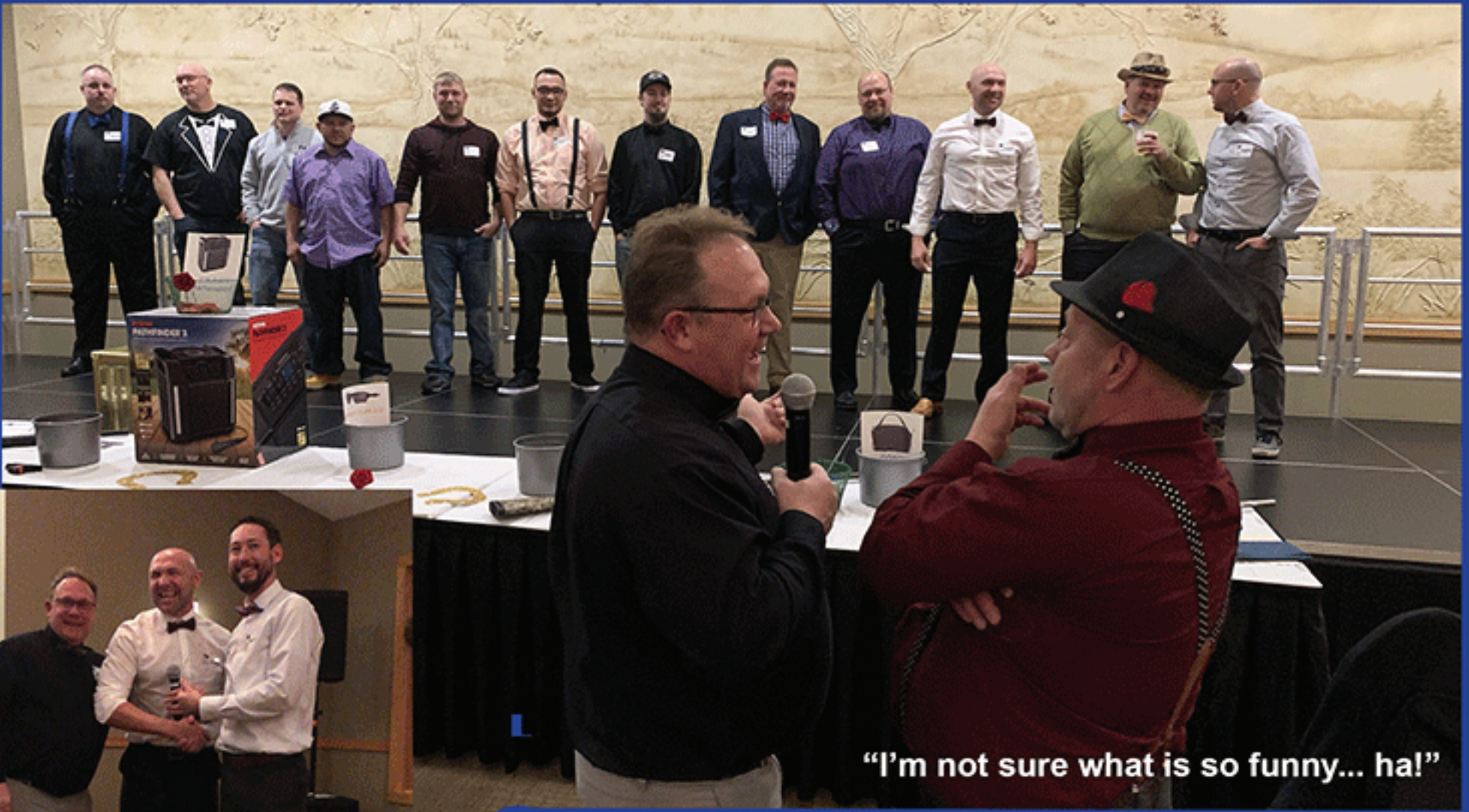
(Above) Perham, MN - February 8th - Friesen's held our annual "Employee Appreciation Party for 2019. The "Newbies" were asked to the stage to sing "Mary Had a Little Lamb" for a fun initiation.